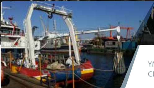
YMV TELESCOPIC BOOM CRANE BOOM OUTREACH

YMV Telescopic Boom Crane occupies less space when in closed position.